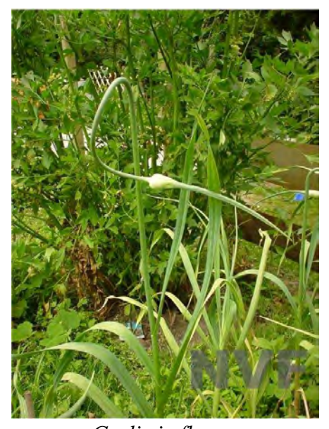
Garlic in flower