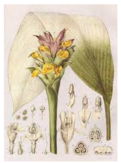
Turmeric in flower